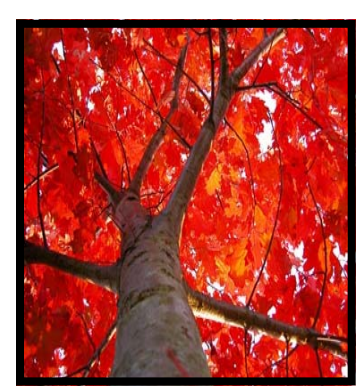
Red Oak: NJ State Tree