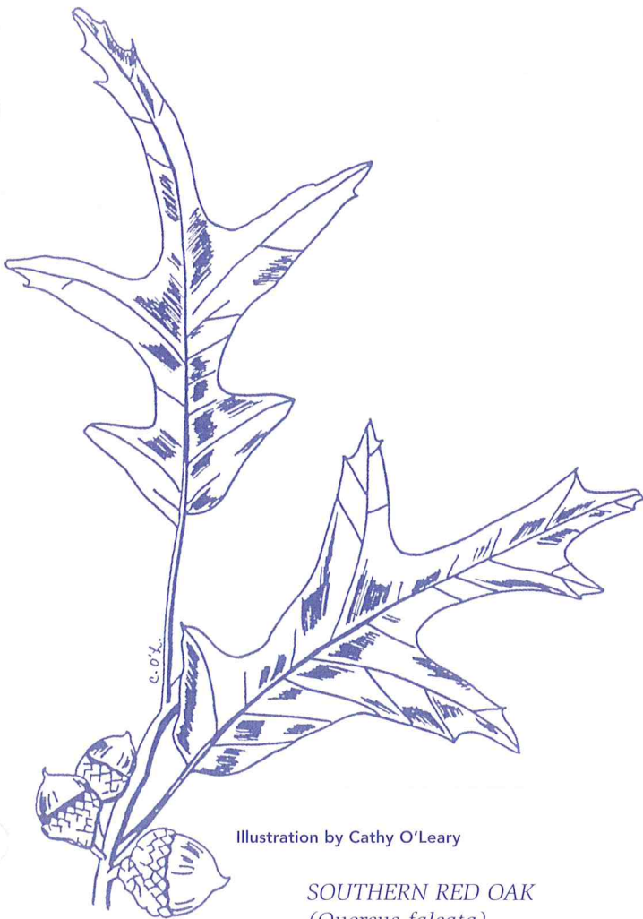
Illustration by Cathy O'Leary