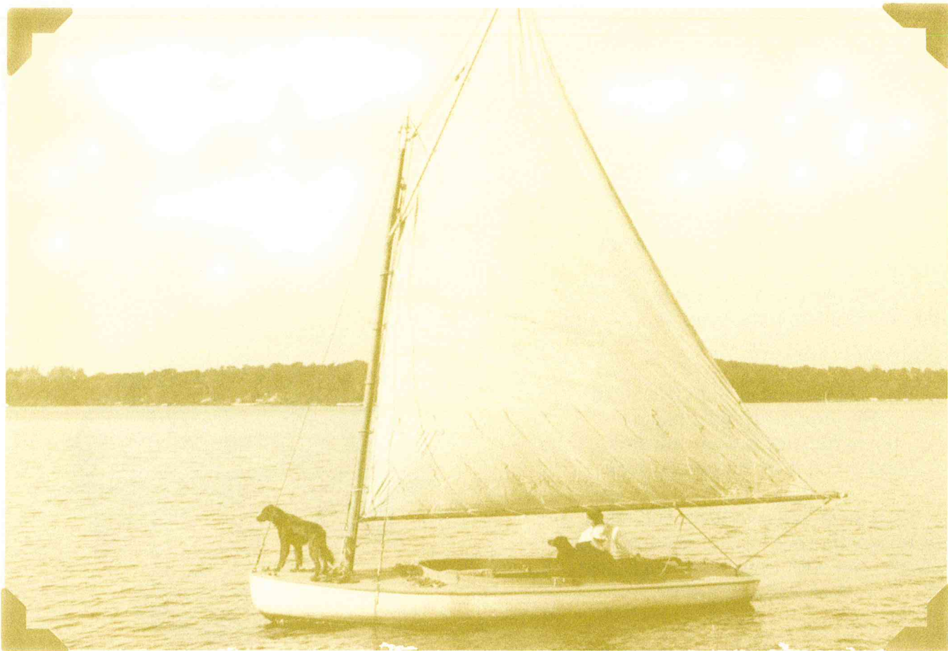
"Dogs on Cat"

And then they said There's a spot that I know where I'm longing to go, One place where I'm aiming to stay, But what ever I do, I am pining for you, old Barney, fair Barnegat Bay.