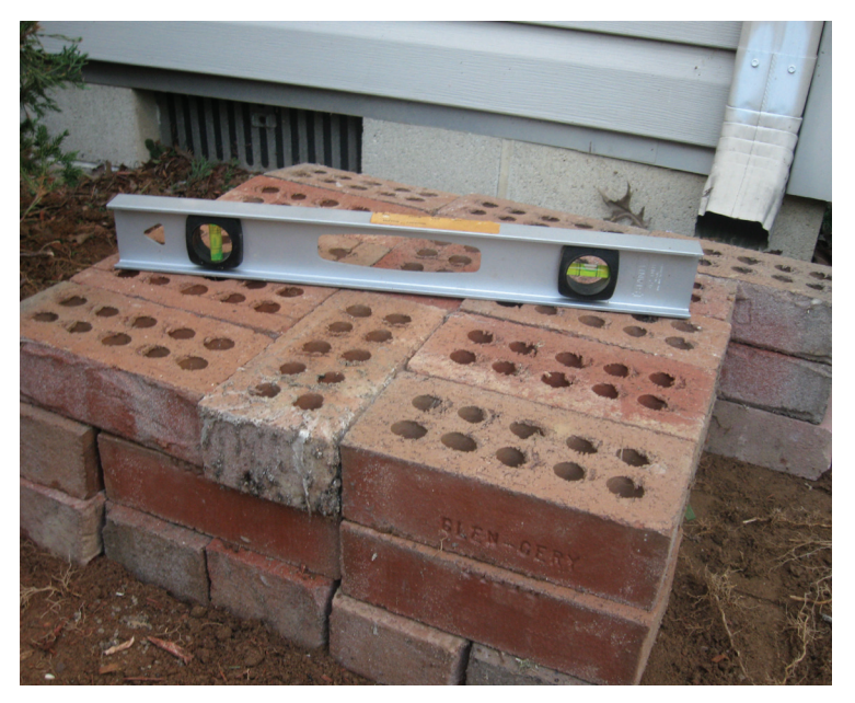
Figure 2. Brick platform used to elevate a rain barrel. The ground below the platform should be leveled out before installing a rain barrel.

Installing a rain barrel under a downspout is simple but does require some planning. Determine beforehand where the over- flow from your barrel will be directed. Consider how the downspout runoff conditions will change when you install your barrel. For example, many downspouts are directed below ground through a stand-pipe, and the roof runoff is discharged to some distant runoff area such as the street. If installing a rain barrel in this situation, determine beforehand whether the overflow will go back into the standpipe or whether you can safely divert the water to a landscaped area and allow some to soak into the ground. Ideally the overflow should be directed to a pervious area where the water can infiltrate into the ground, such as a garden, mulched planting bed, or lawn. This is not always possible especially in more urban, highly developed areas. When it is possible to direct the overflow to a pervious area, overflow should be directed at least six (6) feet from the house or building foundation if there is a basement and at least two (2) feet if there is a crawl space.