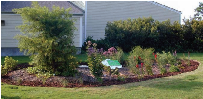
This rain garden helps water infiltrate into the soil rather than runoff.

interpretations. Bulk density is a critical soil property in assessing proper soil function.