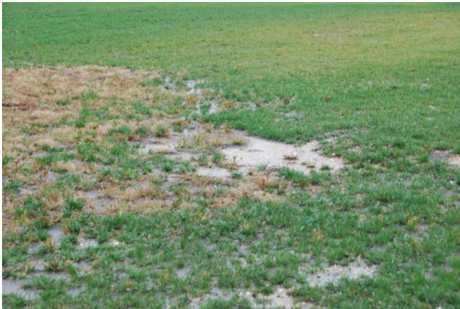
Surface ponding due to compacted soil.

Generally, compaction is a problem within the top 24 inches of the soil. There are several signs of compaction. Discolored or poor plant growth, especially in very wet or very dry years, may reflect the poor soil-plant-water relationships of compacted soils. Excessive runoff on sloping land and ponding on nearly level land are common in compacted areas because water does not infiltrate into the soil.