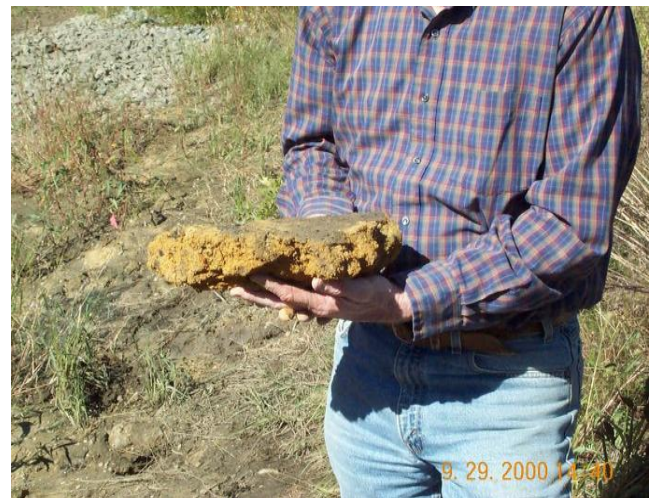
Compacted subsurface layer causing stormwater basin not to function due to lack of infiltration.

Compaction is a familiar sight in areas of road and building construction, but it degrades soil for other important uses. It occurs when moist or wet soil particles are pressed together and the pore spaces between them are reduced. Adequate pore space is essential for the movement of water, air, and soil fauna through the soil. Restricted infiltration results in excessive runoff, erosion, nutrient loss, and potential water-quality problems. Compaction restricts penetration by plant roots and thus inhibits plant growth. Also, it can significantly reduce the rate of rainwater infiltration in new developments, thus increasing the volume of stormwater runoff. Soil is especially susceptible to compaction when it is moist or wet. A low content of organic matter, poor aggregate stability, and moist or wet conditions increase the likelihood of compaction.