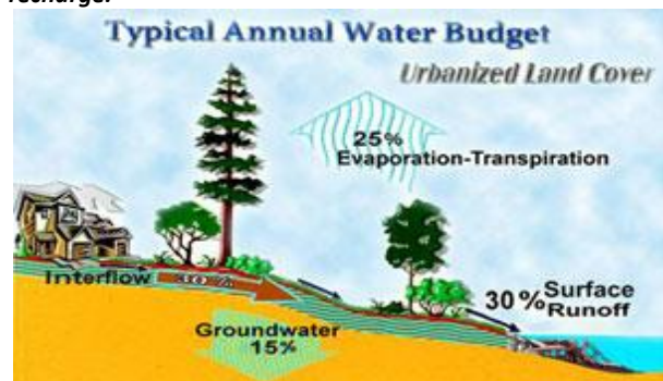
Developed Condition: notice 30% runoff and 15% groundwater recharge.